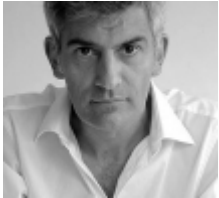
design Alfredo Häberli

With his erice chair, Alfredo Häberli revisits the essential style and clean lines of his segesta and selinunte collection to create a new shape, with a personality of its own. A distinctive trait is the hole in the back, which ensures elasticity and comfort. The exterior profile of the shell recalls the inner shape of the hole, engendering an impression of movement and balance.