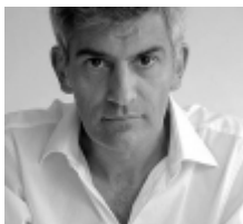
design Alfredo Häberli

With his erice chair, Alfredo Häberli revisits the essential style and clean lines of his segesta and selinunte collection to create a new shape, with a personality of its own. A distinctive trait is the hole in the back, which ensures elasticity and comfort. The exterior profile of the shell recalls the inner shape of the hole, engendering an impression of movement and balance.