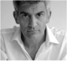
design Alfredo Häberli

Tec is an elementary modular table features slender legs in die-cast aluminium that are hooked onto an extruded aluminium structure set back relative to the edge of the table top. On the one hand, this configuration achieves an interesting visual effect as the top seems to be floating in the air and, on the other hand, thanks to the structure's rigidity, it is able to support extremely long tops thereby making it possible to choose from a very broad range of sizes.