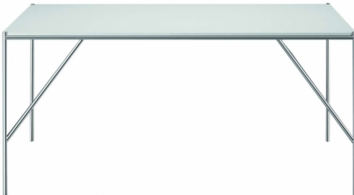
Table with structure in brushed stainless steel 316. Top in white Full Color plywood, satin-finished or white lacquered glass, Full Color milled or HPL-WOOD milled.