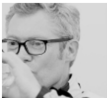
design Jasper Morrison

The direct and concise language of Jasper Morrison is applied to the spaghetti chair. Today, Jasper Morrison offers his own original reinterpretation of this Alias icon, 30 years after its introduction. A highly innovative follow-up, tagliatelle is a chair inspired by the perfect synthesis of technology and form incorporated in the spaghetti chair, extracting and reformulating each and every element.