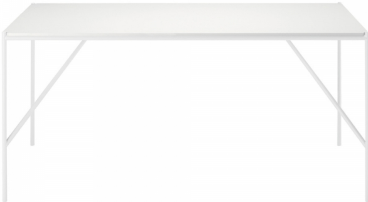
Table with structure in stove enamelled steel. Top in Full-Color plywood, satin-finished or white lacquered glass.