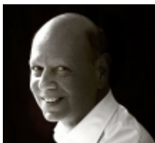
design Dante Bonuccelli

Linear. Light. Of a rigorous elegance. Bookshelves as the tasteful backdrop of a home or office. Designed by Dante Bonuccelli.