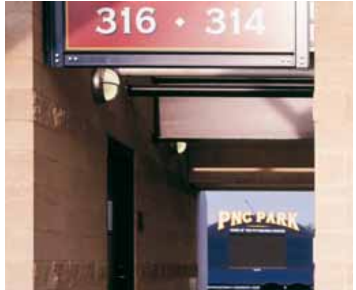
PNC Park, Pittsburg, Pennsylvania, USA. Architect: Ross Murphy Finkelstein.