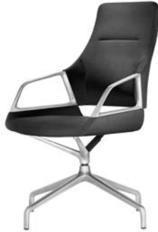
301 / 5