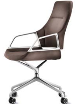
302 / 5

The Graph conference chair is available with a medium-high and high backrest and with glides or castors. Choose from polished aluminium, bright chrome-plated or powder-coated frame surfaces in black or white, each with the matching armrests. The covers come in high-quality fabrics, or the two types of leather from the Wilkhahn collection.