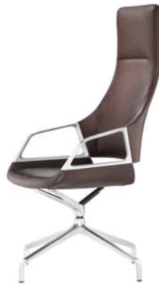
302 / 5