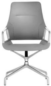
301 / 5