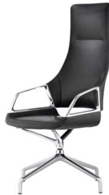
302 / 5