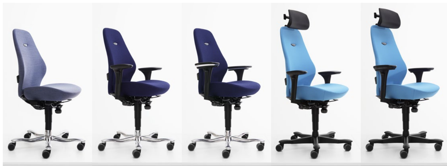
8770 / 6770