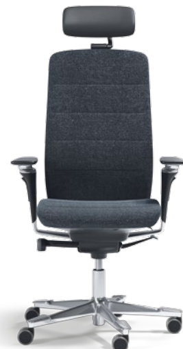
Polished Edition (EDP)