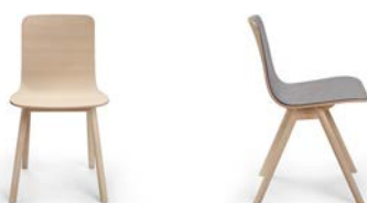
KALI Chair By Jasper Morrison