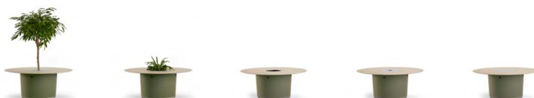
ON POINT Table By Mattias Stenberg