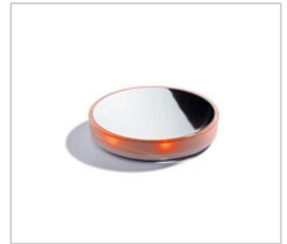
Good night design by Laurene Leon Boym

Floor lamp providing soft light - close to the floor