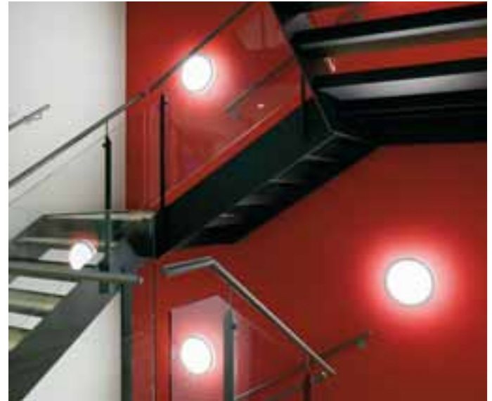
Keops Headquarter. Harvings Pakhus, Copenhagen, Denmark. Architect: Aarhus Arkitekterne A/S. Interior designer: Christiansen Arkitekter MAA PAR.