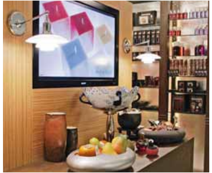
etranger di costarica. Shop at AXIS Building, Tokyo, Japan.