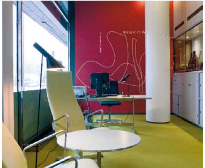
Radisson SAS Royal Hotel. Copenhagen, Denmark.