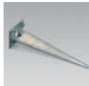
Erdspeiß Earth spike Picchetto