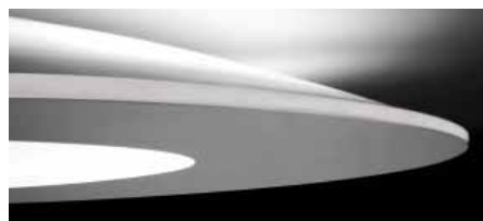
Polythene top diffuser and acrylic bottom diffuser.