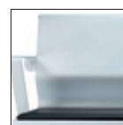
Sedile imbottito e schienale in lamiera traforata Padded seat and backrest in perforated plate