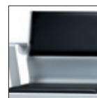
Sedile e schienale imbottiti Padded seat and backrest