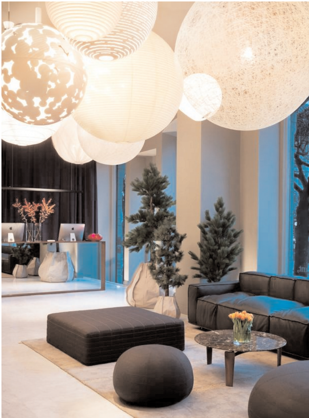
Nobis Hotel – Stockholm