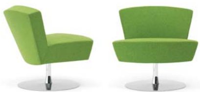
Tinto Swiveling easy chair by Claesson Koivisto Rune